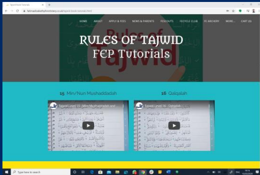
Online Tajwid Tutorials

We have also completed our 'Online Qaidah & Tajwid Tutorials' see links below, Click on each sample page and video to get an idea: