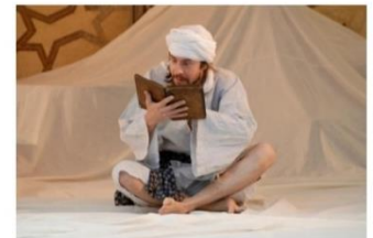
Khayaal Theatre

Relax in the Great Court terrace and enjoy screenings of short films from across the Islamic world.