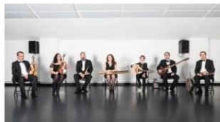
The London Syrian Ensemble

Join this all-female Muslim poet panel as they discuss women's contribution to Islamic art and society across time. In collaboration with Poet in the City.